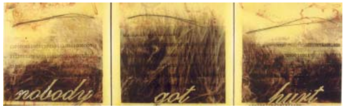
OUR FAVORITE ADDICTIONS 36"x12"