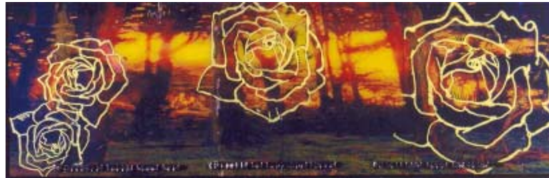
SWEET ICE 36"x12"