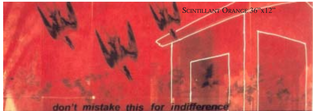
SCINTILLANT ORANGE 36"x12"